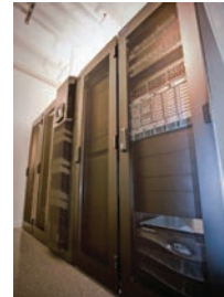
Data Center Lab

To take advantage of iVision's Solution Center, please email us: solutions@ivision.com or call 678.999.3002.